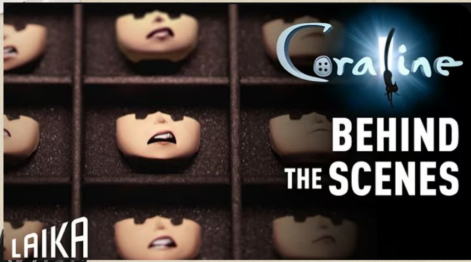
Biggest Smallest World: Behind the Scenes of Coraline | LAIKA Studios